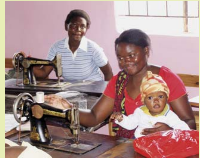
You built a facility for sewing and literacy classes for impoverished women in Zambia.