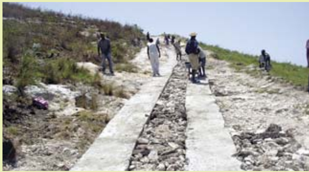
You repaired vital roads in Haiti leading to health centers.