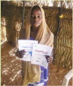
You distributed textbooks to internally displaced children in war-torn Sudan.