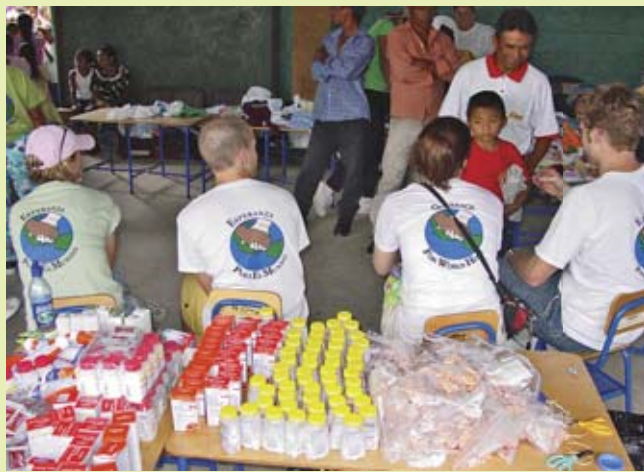
You brought medicines to nearly 2,000 Guatemalans.