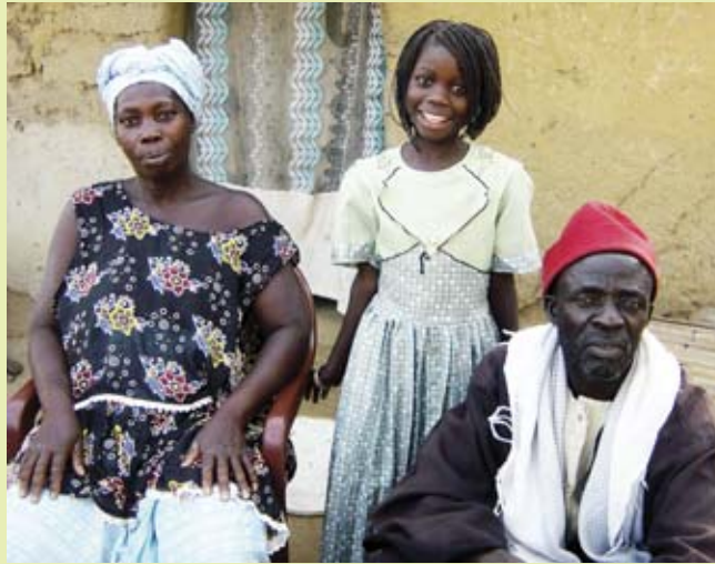
You facilitated the education of dozens of young girls in Senegal.