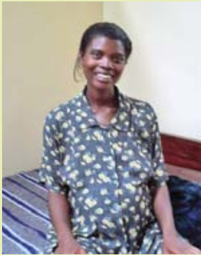
You helped construct a Waiting Mother's Hostel in Uganda.