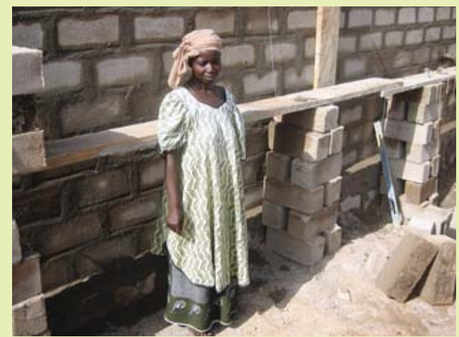
You funded a women's cooperative in Mali to sell Shea butter products.