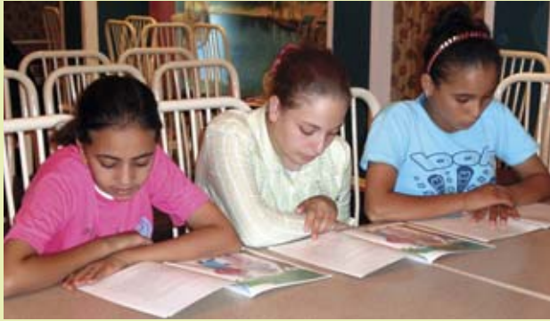
You supported a literacy project in Egypt.