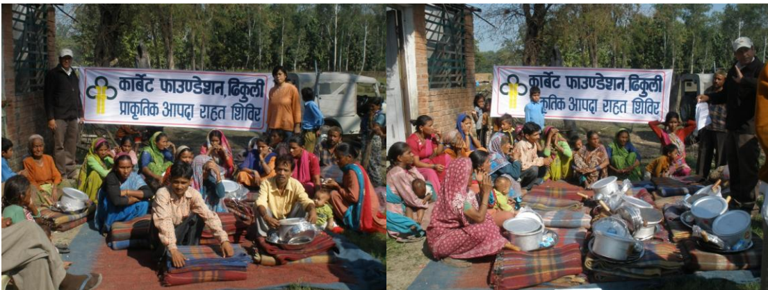
Flood Relief Programme at Amdanda

The Corbett Foundation distributed blankets and utensils to the flood affected families in Amdanda village on 29.10.2010 on the basis of the survey done earlier by the members of the foundation. The relief material was distributed to a total number of 17 families of Amdanda .Based on the extent of the damage in the flood eight families were identified as severely affected from flood thus a set of utensils and two blankets was distributed to each of the eight family and two blankets were distributed to the rest of partially affected nine families.