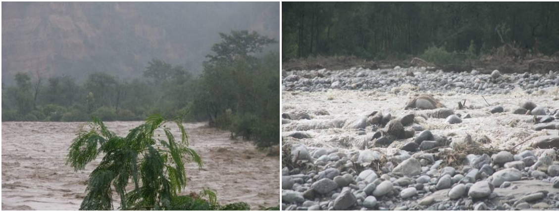
Flooded Kosi River

This monsoon, the heavy rain has caused havoc in the villages around the Corbett Tiger Reserve and Ramnagar Forest Division. Particularly, villages like Kunkhet , Mohan , Chukum , Sunderkhal and Amdanda khatta have suffered heavy damage in terms of property loss. Several people have lost their lands and dwelling. People have also lost their household goods and are now facing acute shortage in terms of food. In Dhikuli village the flooded Kosi has destroyed many resorts and has also damaged the agriculture land of some villagers. Some parts of Ramnagar town like Pampapuri has also faced the consequences and now the town is facing severe drinking water problem. The level of water in Kosi river was 1 lakh 60 thousand Cusec meter, which was more than year 1993, during that that time also Kosi had shown its furious face.