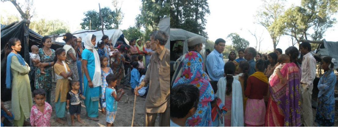
Clothes distribution at Sunderkhal village

The Corbett Foundation in its interim flood relief programme distributed old clothes to twenty three affected families of Sunderkhal village on 26.10.2010 who were living in tents on the roadside.