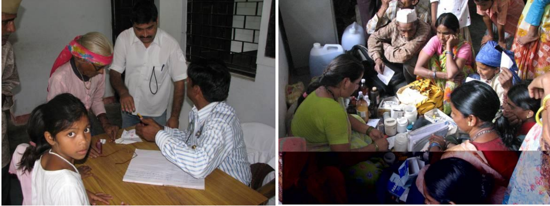
Medical assistance to flood affected people of village Chukum